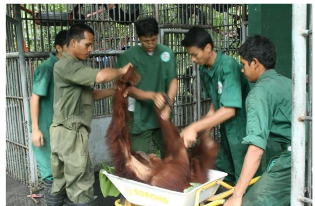
Orangutan being darted while a keeper attracts attention Anaesthetised orangutan being moved to the transport cage