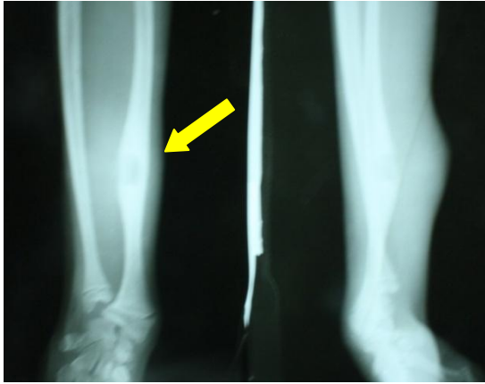
Bone (ulna) swelling and empty space inside the bone