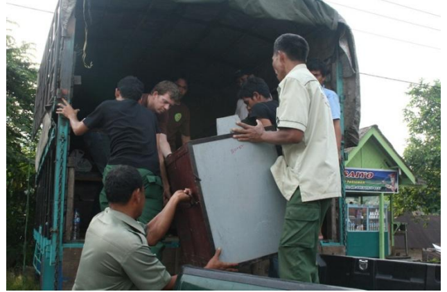
Transport cages being loaded onto the truck on the main road, about 2 km from the Batu Mbelin quarantine centre near Medan, prior to the long journey